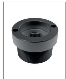
12097.W2131 to .W2501 - Face mount compact receivers - compact