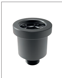
12095.W2131 to .W2504 - Locator unit - compact