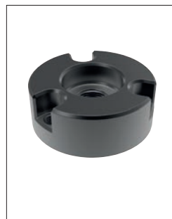
12097.W0131 to .W0501 - Face mount receivers - standard