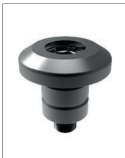
12095.W0131 to .W0504 - Locator unit - standard