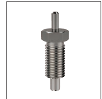
Threaded for bespoke handle