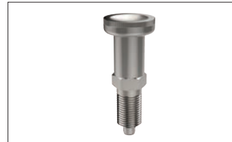
Stainless body and grip