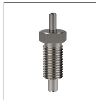
Threaded for bespoke handle