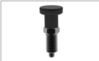
Steel with plastic grip