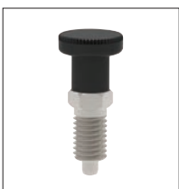
Fine threaded (standard)