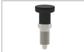
Stainless with plastic grip