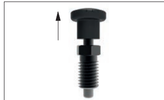
Non locking (spring back)