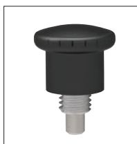
Thin wall mount