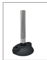
Bolt down base