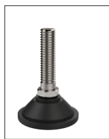
Standard nylon base