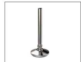
Stainless thread - Stainless base