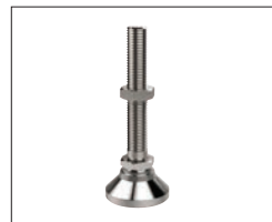
Steel thread - Steel base