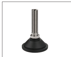
Steel thread - Nylon base