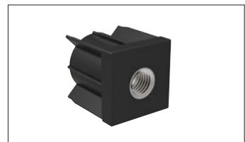
Hollow section bushed insert