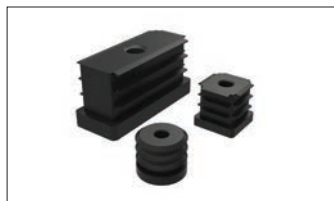
Hollow section insert