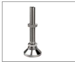
Articulating levelling feet