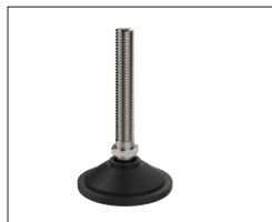
Stainless thread - Nylon base